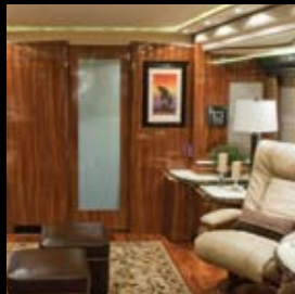
Cockpit Privacy Doors