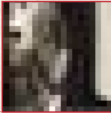
480i (CRT glass tube TV)