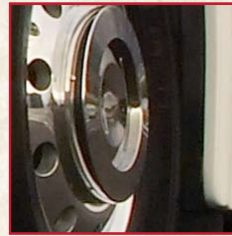
1080p (full HD)