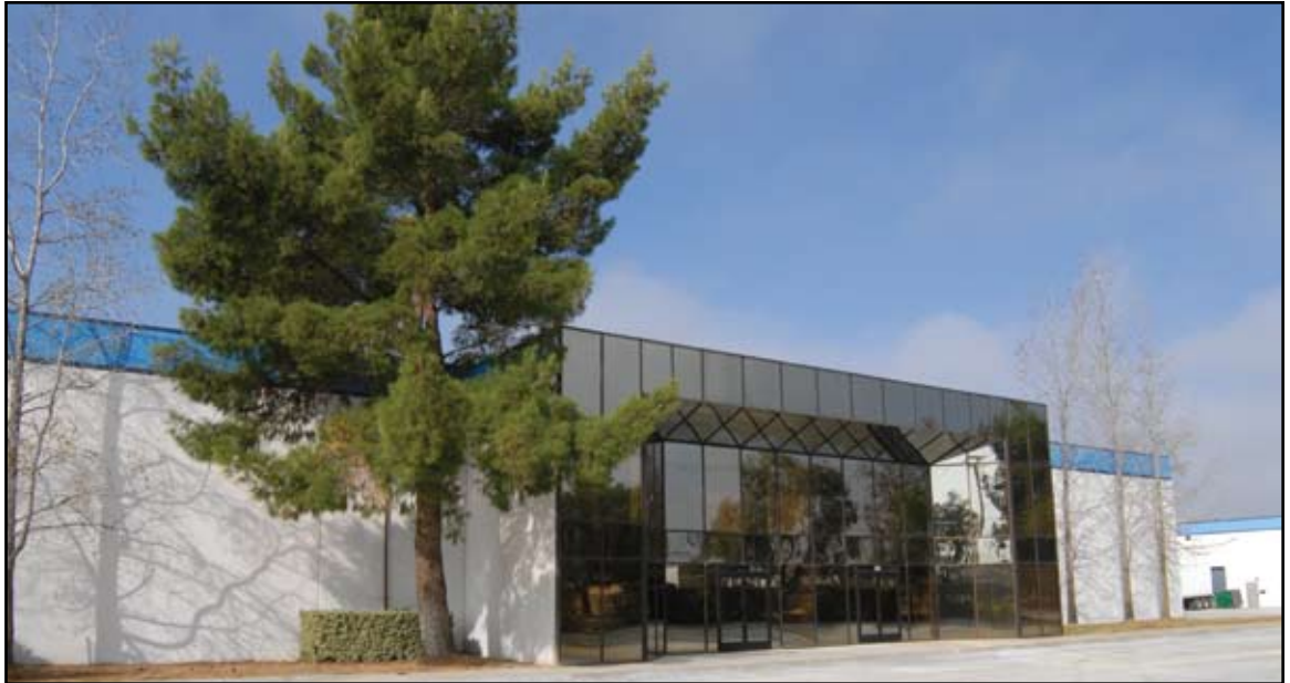
Marathon Coach California