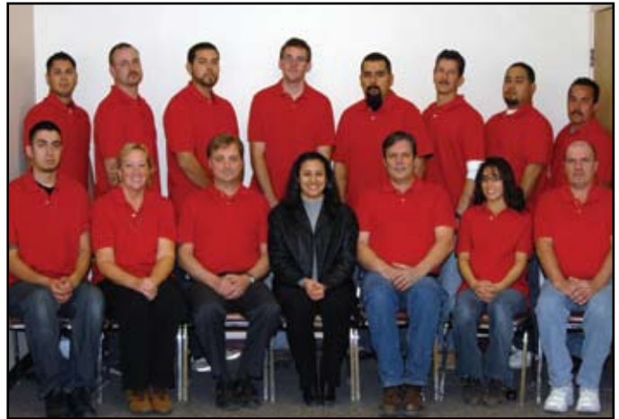
Marathon Coach California's support staff and team of skilled technicians are eager to greet customers and provide excellent customer service.

relax and feel pampered. While their coach is being serviced, customers can unwind in one of two customer lounges or visit the media room, which is equipped with two built-in workstations, wireless Internet service, and telephones. Because the company's top priority is putting the customer's needs first, small details such as rolled-up washcloths, scented soaps, and hand lotions in the restrooms provide an added exclusive treatment that Marathon customers deserve.