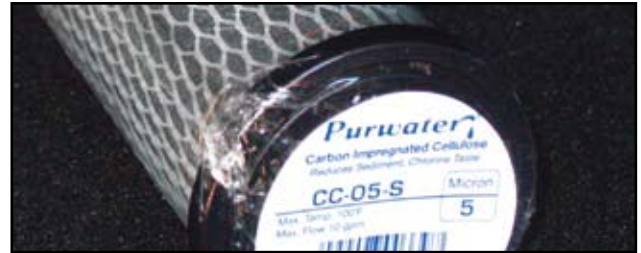
Ametek Water Filter Cartridge