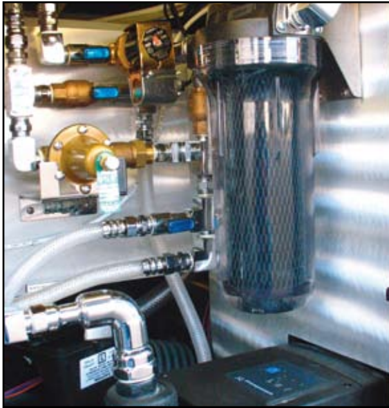
Ametek Water Filter